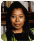
Alice Walker born 1944