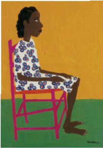
Lies Sweet (1944), William H. Johnson. Oil on paperboard, 28" x 22". Smithsonian American Art Museum, Washington, D.C.

What do you infer about Mama from her description of herself? Cite specific details.