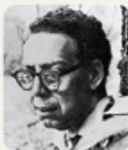
Robert Hayden 1919-1980