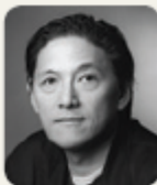
Li-Young Lee born 1967

Robert Hayden grew up in a poor neighborhood in Detroit, Michigan. He was raised by neighbors from an early age after his biological parents separated. Although Hayden's foster parents made sacrifices for his education, their troubled marriage fueled spells of depression in him. Hayden sought escape from his "dark nights of the soul" by reading and writing poetry. His first collection came out in 1940 as Little Fugate . However, by 1962, when "Those Winter Sundays" was published in the volume A Ballad of Remembrance , Hayden was on his way to becoming a prominent poet.