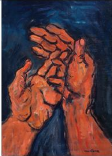
Marc Chagall, Mains de Maïa (Hands of Maia), 1950.

Sundays too my father got up early and put his clothes on in the blueblack cold, then with cracked hands that ached from labor in the weekday weather made banked fires blaze. No one ever thanked him.